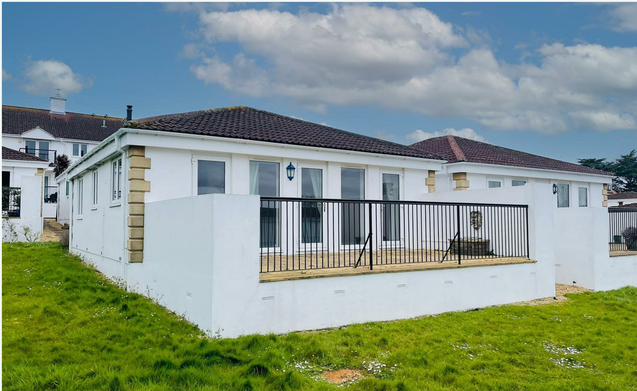
24 The Vineyard, Yarmouth, Isle Of Wight, PO41 0XE